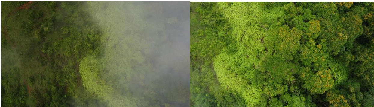
Figure 3: Two drone images shot at almost the same angle. Left: Highly faded by clouds. Right: Favourable outcome with low cloud interference.

At first, the idea of taking the pictures around the same time in the morning came up so the sun would not reach over the hills yet and lighting conditions are somewhat similar. Though the lighting was mostly identical in the morning, the idea was soon discarded as