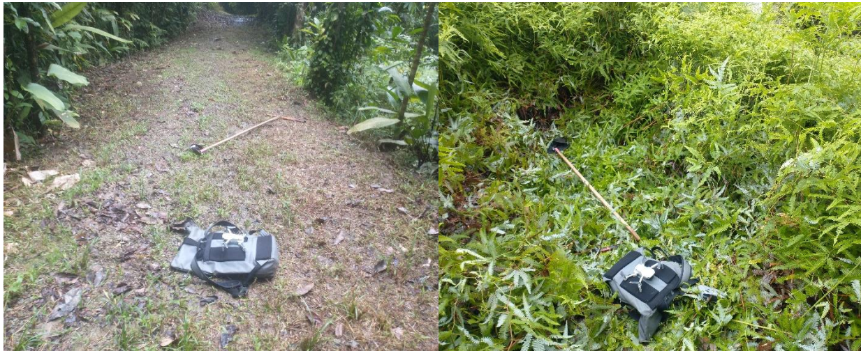
Figure 1: Drone set up with a reference stick, backpack as a starting and landing point with drone on top. Left: Good landing conditions with even ground and no vegetation above. Right: Improvised landing strip after clearing the area of fern.

Data acquisition consisted of two main tasks, flying a drone and measuring trees. Drone imagery was taken with the DJI MINI 2, which produces good images but does not come with extensive safety features. Thus, requiring an even landing strip and clear overhead conditions, meaning no vegetation above the starting and landing point. Especially on sites that were chosen with Google Earth these conditions were rarely met as the fern sites were always located on slopes and sometimes very far away from any sort of trail. A backpack was always used as a starting and landing platform to protect the rotors from any damage due to irregularities in land covering (see Figure 1).