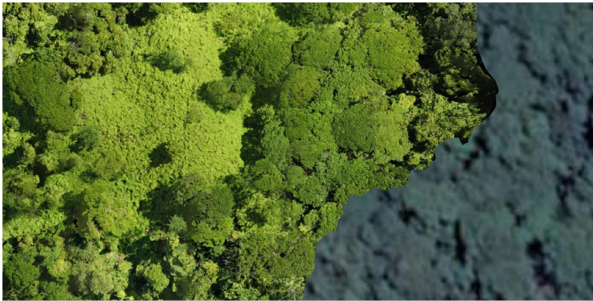
Figure 5: Part of a processed image embedded in QGIS. The left side of the image shows the drone imagery while the right side shows the underlying satellite image. The fern dominated area is reflected in a light green from the left side to the centre.

After gathering the drone images, they were processed using Agisoft Metashape 1.8.3. Through various steps, that sometimes took upwards of 24 hours, one big, georeferenced picture could be created that can be imported in Geographic Information Systems (GIS). The high demand of time and storage to process the imagery came as a surprise. Two additional flash drives, with a capacity of 128 GB each, had to be bought as the computer that was being used stopped working due to reaching its storage capacity. Furthermore, not all processing could be done in the research facility. Figure 5 shows part of a finished image, that has already been imported in the open-source GIS QGIS and laid over a satellite image of 2015. The fern dominated areas can easily be spotted and the improvement between a satellite on the right and drone image on the left is apparent.